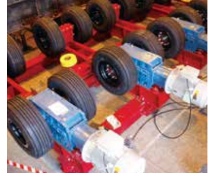
Sepro Pneumatic Tyre Drive System (PTD)