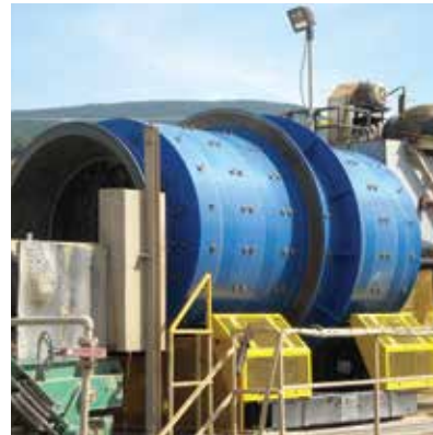
2.4 x 4.2 Sepro Scrubber