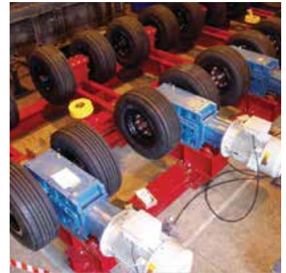
Sepro Pneumatic Tyre Drive System (PTD)

*Engineered replacement for North American built 8 ft. x 14 ft. Scrubber.